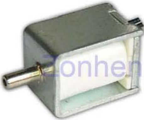
总重量 Total Weight: 18g 应用范围: 食品真空包装机 APPLICATION: FOOD VACUUM PACKING MACHINE

ISO/TS16949 ISO9000 ISO14000 RoHS REACH CE UL VDE TÜV